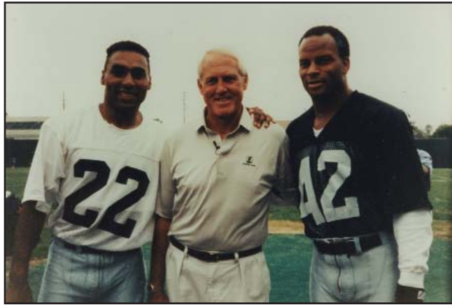
Roger Craig, Coach Bill Walsh, and Ronnie Lott

The name Ronnie Lott screams toughness and excellence. As a ten-time Pro Bowl selection and a first-ballot Hall of Famer, Ronnie is one of the most respected figures in professional sports. Add his four Super Bowl rings with the San Francisco 49ers to what was arguably his best season, leading the NFL in interceptions with the Oakland Raiders, and you've heard only part of the story. Off the field, Lott is known as a tireless advocate for children. His nonprofit, All Stars Helping Kids, has raised millions of dollars to improve the lives of at-risk young people. Even more, Ronnie is a coach and catalyst for other athletes who have a heart for making their communities a better place.